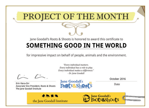
Project of the Month:

https://www.rootsandshoots.org/projectofthemonth2016